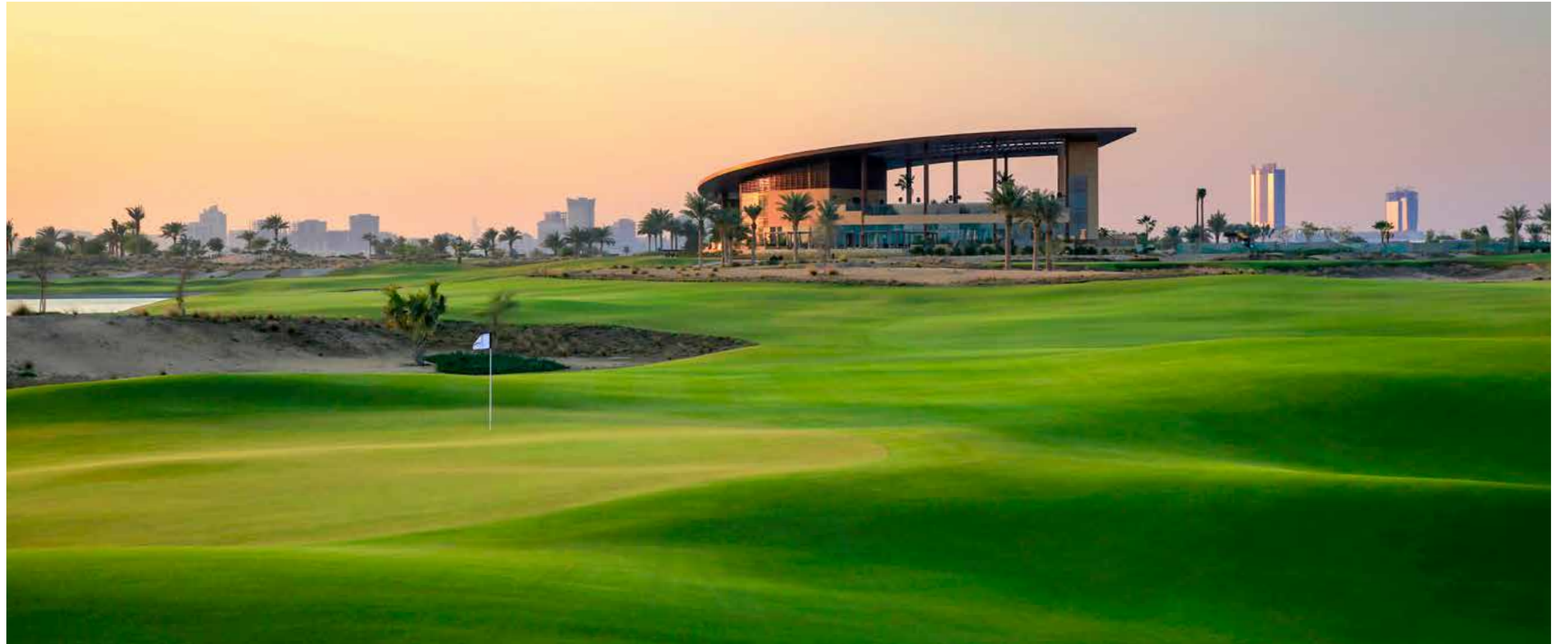
Trump International Golf Club Dubai